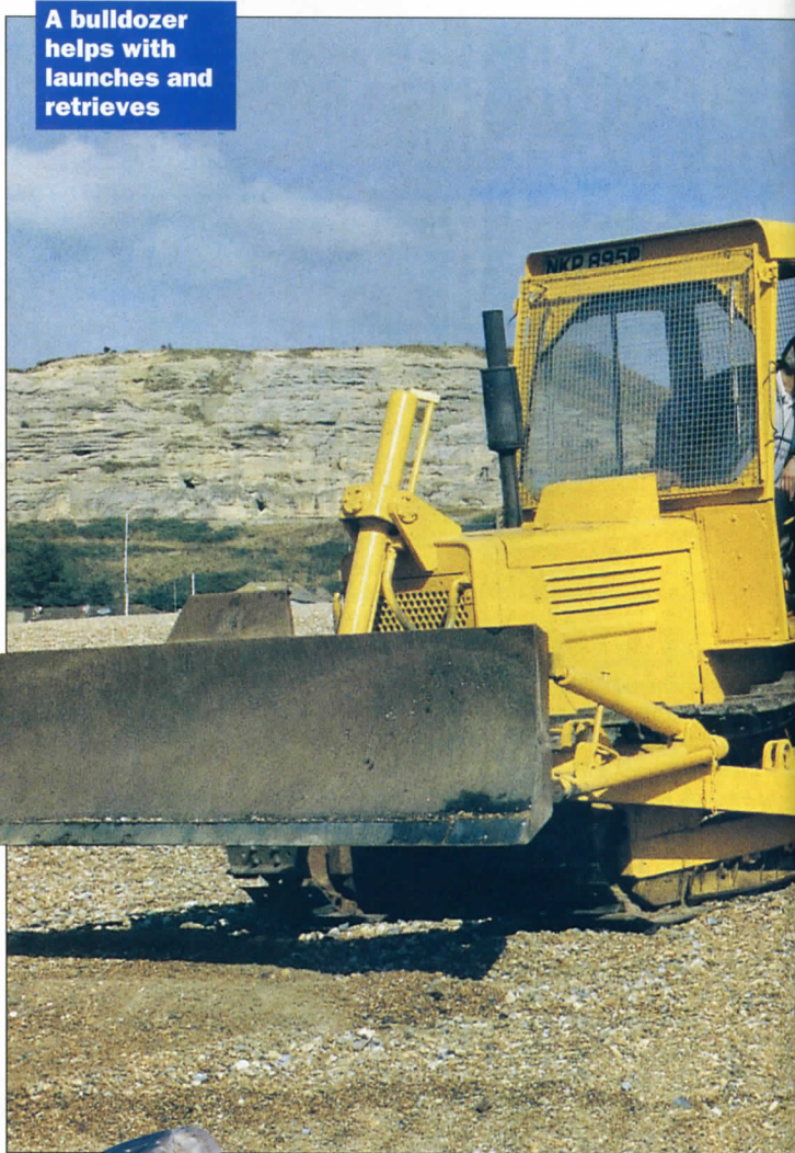
A bulldozer helps with launches and retrieves

F ROM HUMBLE beginnings, when members met in a wooden hut, the East Hastings SAA has grown into one of the wealthiest, best-equipped and great value for money sea angling clubs in Britain.