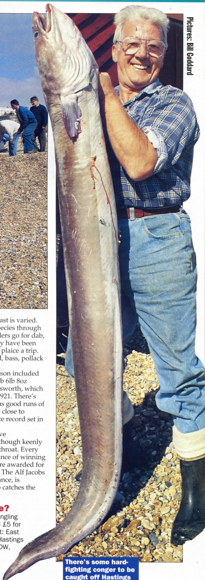
There's some hard-fighting conger to be caught off Hastings

Local tackle shops offer club members 10 per cent discount on gear.